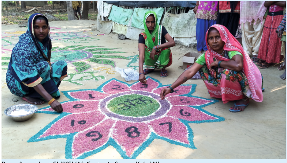
Rangolis made at SHIKSHA<sup>+</sup> Centre in Sarura Kala Village