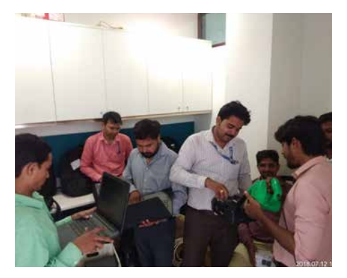
SHIKSHA Initiative IT Team in Action, Picture: Right of CoE tam and left photo is from Expansion