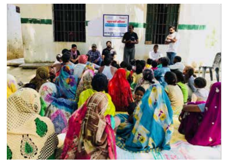
SHIKSHA Initiative team members organizing village meeting

School Chalo Abhiyan" of Sarva Shiksha Abhiyan, to generate awareness for enrolling in schools. Drivelasted for five days and community mobilization activity (May 7-11,2018) was carried out in villages of Kasmanda block, Sitapur (U.P.). School and community are the most important stakeholder for a child's education and their aligned, active participation can help to change the scenario of a child's education.