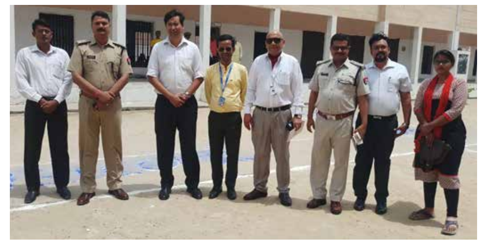
SHIKSHA Initiative team members with jail authorities

Considering the fact, SHIKSHA Initiative is working to address it through its profound intervention among the Adult illiterate through its SHIKSHA<sup>+</sup> program. In view of the above, SHIKSHA<sup>+</sup> expanded its operation in District Jail Gautam Buddha Nagar, on the request of Superintendent of Jail. A letter of intent